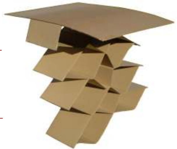
Drop Core Filler