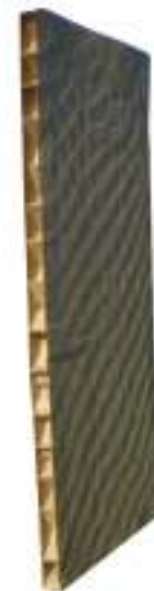
Core Cell Panel

Use this panel to take up additional voids in containers.