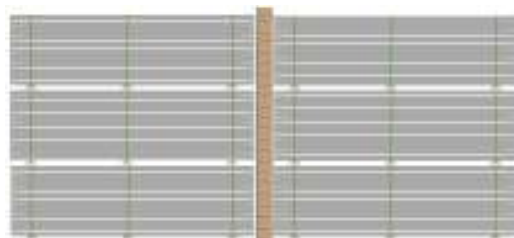
Void filler – use between panel units