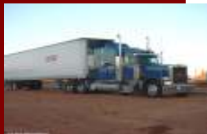
Over the road